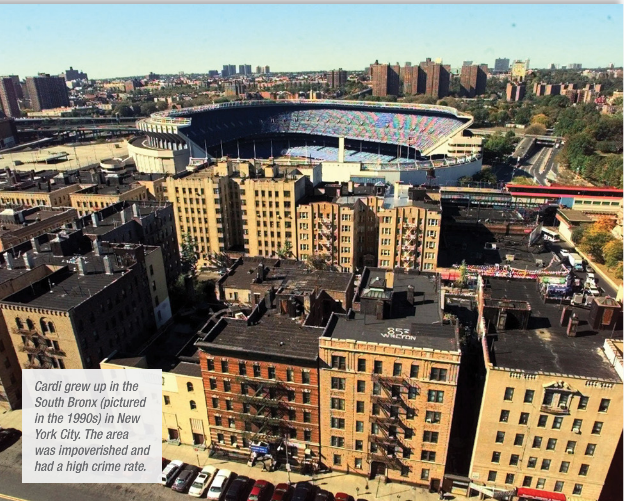
Cardi grew up in the South Bronx (pictured in the 1990s) in New York City. The area was impoverished and had a high crime rate.

Cardi’s reality included a very stern mother who severely limited her social life—including prohibiting her daughter from going on sleepovers with friends. And Cardi was afraid to disobey, saying she was always more afraid of her mom than the gang-bangers at school. While Cardi’s mom imposed restrictions to keep her daughter from joining a gang, she had another reason to be protective: Cardi’s health was fragile. She suffered from chronic asthma; after a severe attack, she might end up in the hospital for two weeks or more. At home, Cardi used a breathing apparatus called a nebulizer machine, which delivered medicine to her lungs to help her breathe. However, the medicine gave her tremors. Cardi later recalled, “My mom used to cry a lot be-