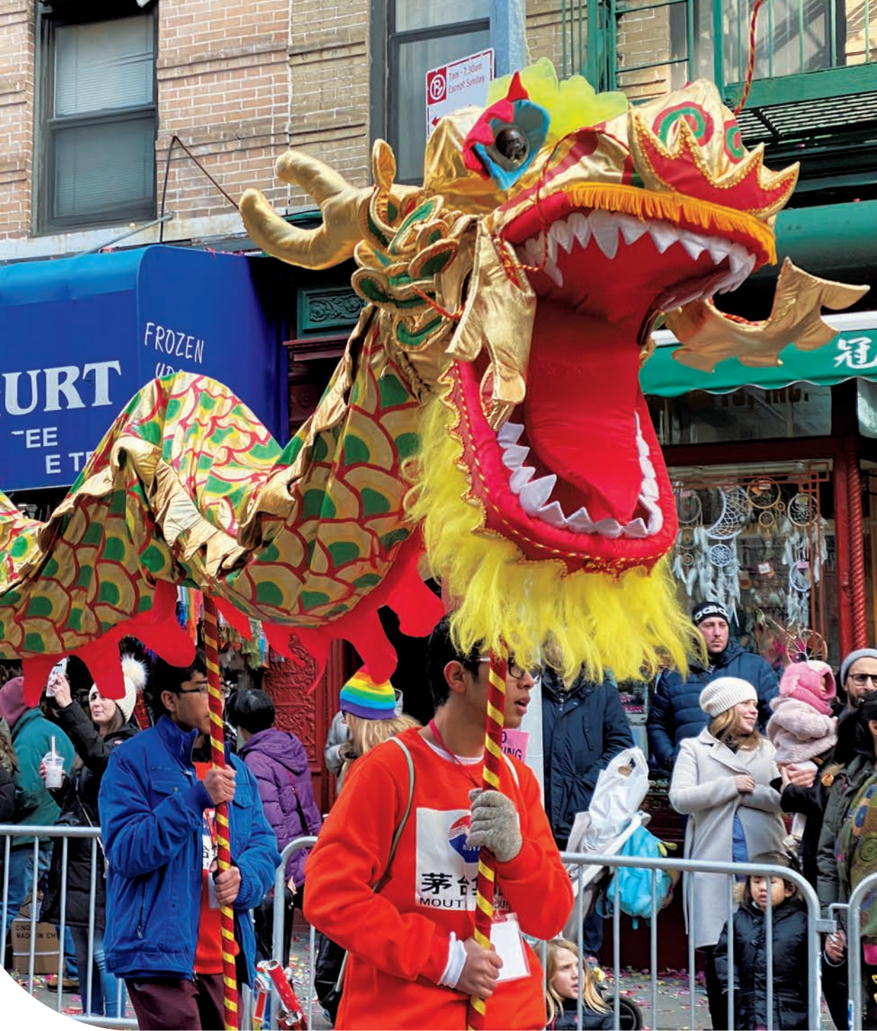
Dragon dances are a major part of many Chinese New Year celebrations.