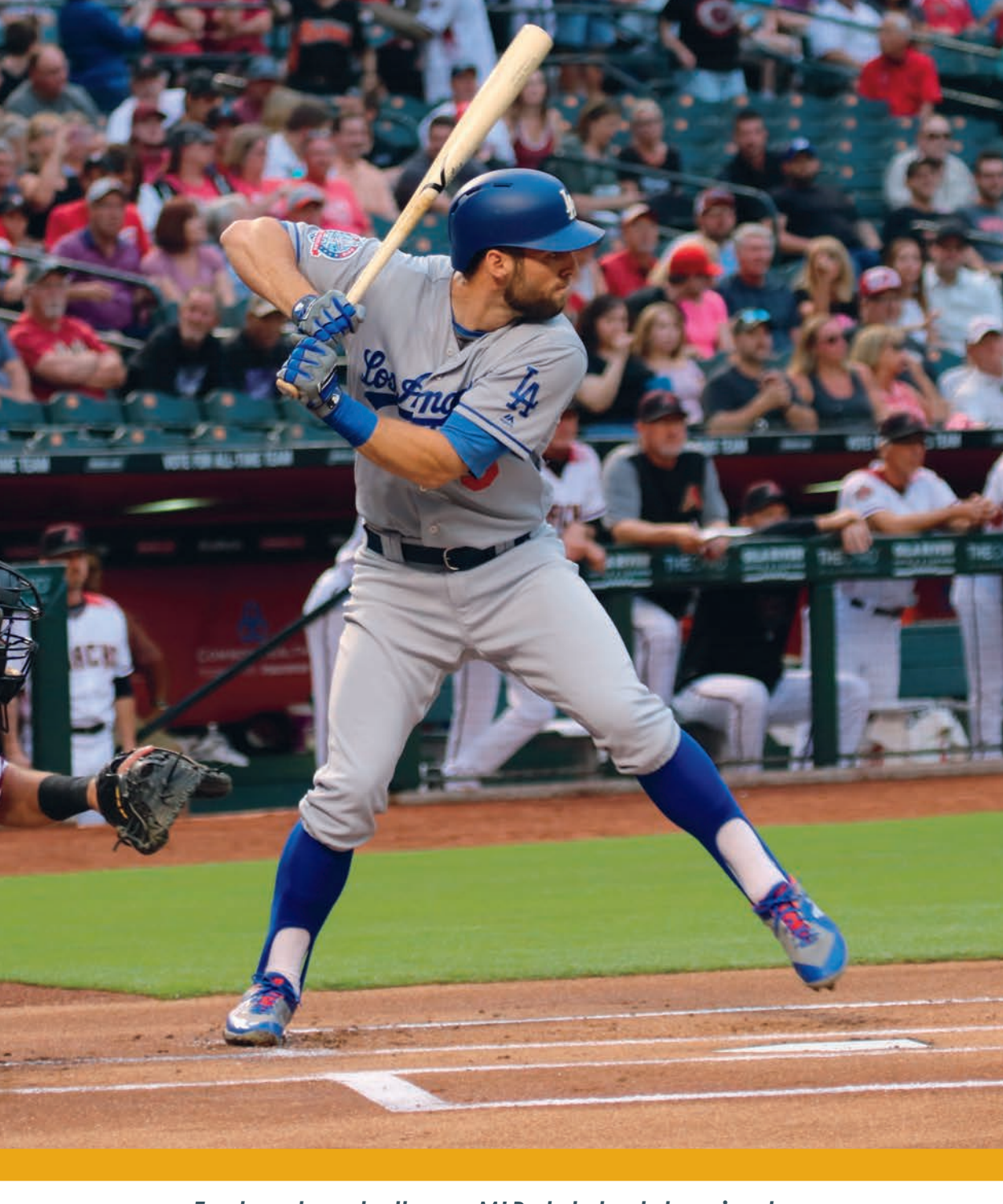
Fantasy baseball uses MLB stats to determine how well fantasy teams do.