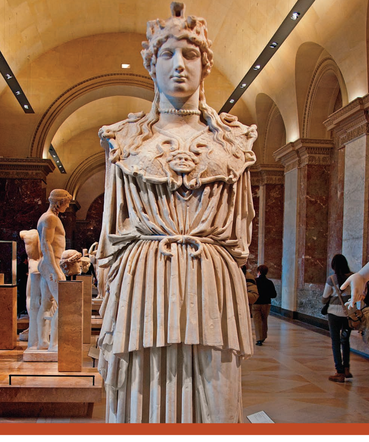
The Romans made copies of Greek statues, such as the Athena Parthenos.